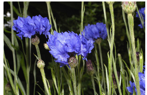
In cultivation. Photographer: John Smith-Dodsworth, Licence: CC BY-NC.