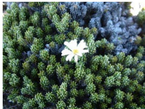
Old Man range, January. Photographer: John Smith-Dodsworth, Licence: CC BY-NC.