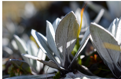
Rock and Pillar Range; abaxial leaf. Date taken: 20/04/2014, Licence: CC BY-NC-SA.