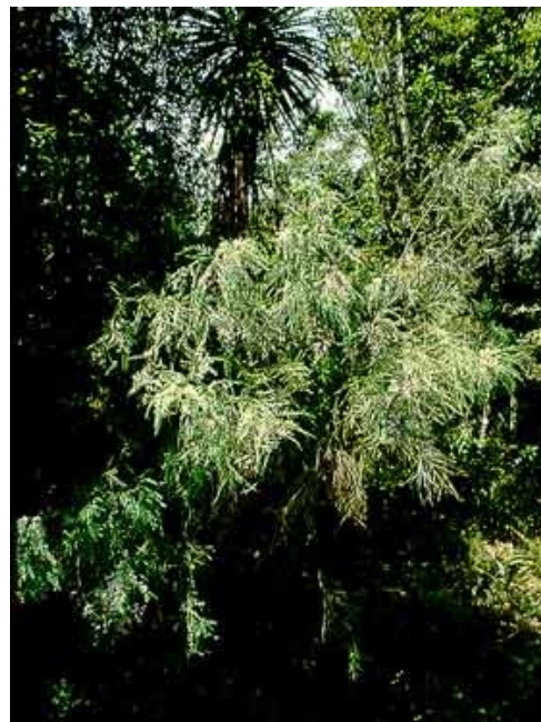
Pahaoa valley, December.