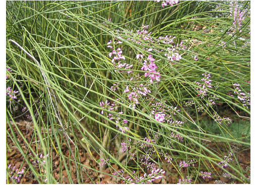
Carmichaelia glabrescens.