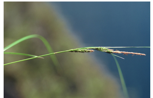
Surville Cliffs.