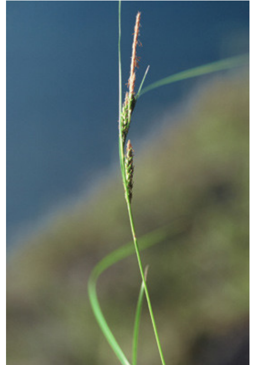
Surville Cliffs.