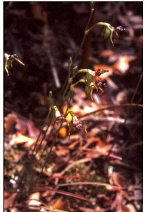
Sullivania minor plant, November, Whakarewarewa.