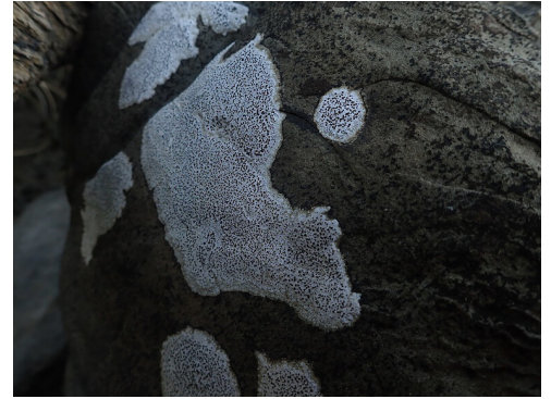
On coastal concretions, Hokianga Far North.