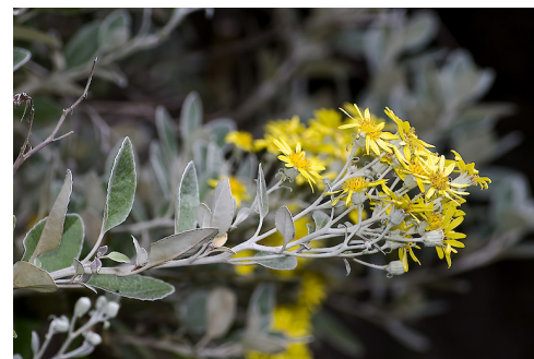
In cultivation.