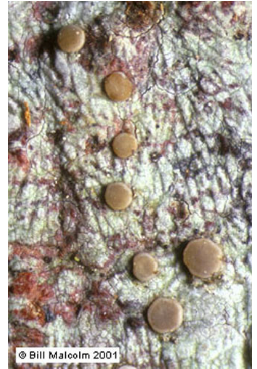
Photographer: Bill Malcolm, Licence: All rights reserved.