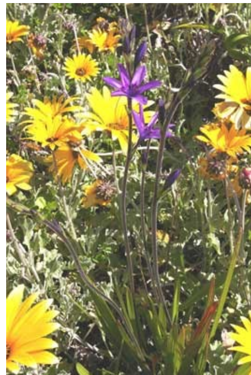
Rings beach, Kuaotunu, Sept. Photographer: John Smith-Dodsworth, Licence: CC BY-NC.