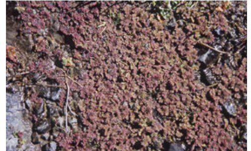
Azolla.