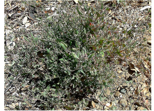
Atriplex patula, Tapu, Coromandel.