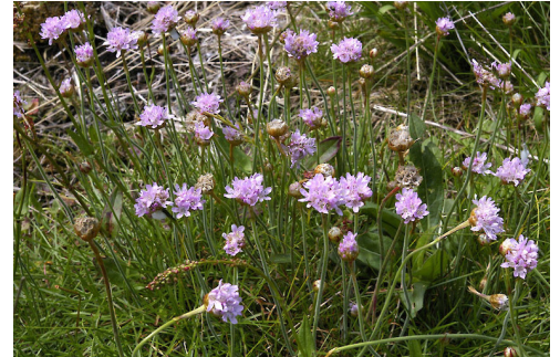
Armeria maritima.