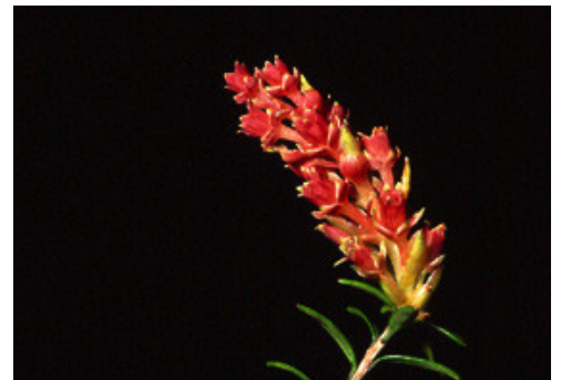
Female flower, Arthurs Pass, December.