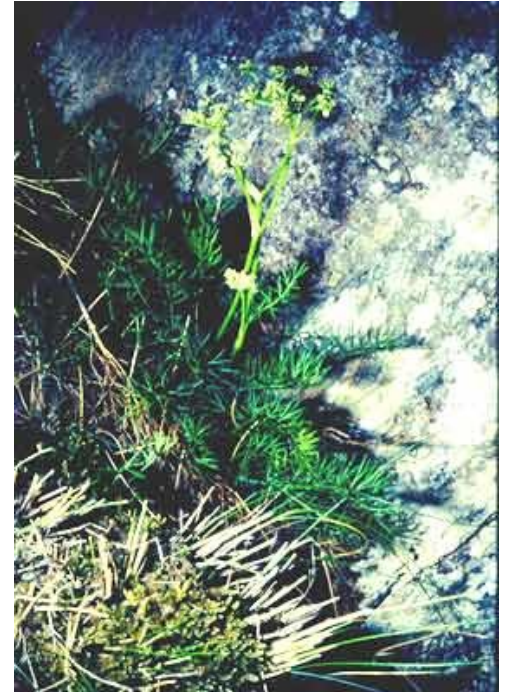
Danseys Pass, November.