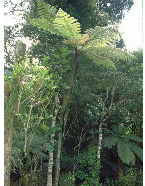
Cyathea cunninghamii.