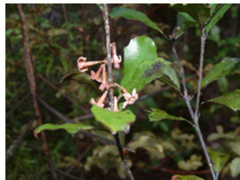
Waharau Park, Hunua Range, October.