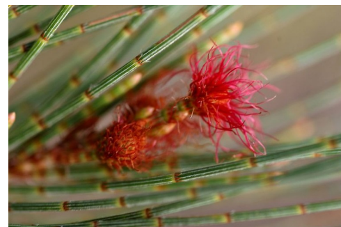
Fitzroy Island, Queensland; female flowers. Date taken: 10/06/2011, Licence: CC BY-NC.