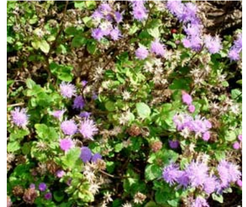
Ageratum houstonianum in flower (wild plant), Dover Road, St Andrews, Hamilton.

Date taken: 07/05/2006, Licence: CC BY-NC.