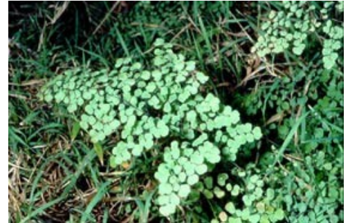
Stony Bay, Coromandel.