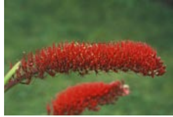
9. Xeronema callistemon f. callistemon , Poor Knights lily, raupo-taranga.