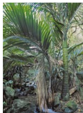
5. Rhopalostylis sapida , nikau palm.