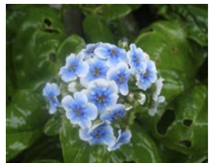
2. Myosotidium hortensia , Chatham Island forget-me-not, kopakopa, kopukapuka.