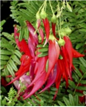
7. Clianthus maximus , kakabeak, kowhai ngutu- kaka.