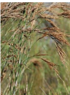
3. Sporadanthus ferrugineus , bamboo rush, giant wire rush.