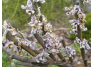
8. Carmichaelia crassicaulis subsp. crassicaulis , coral broom.