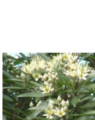
4. Ixerba brexioides , tawari, whakou (flowers).