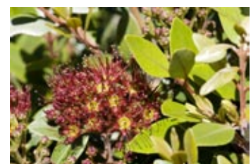
6. Metrosideros robusta , northern rata.