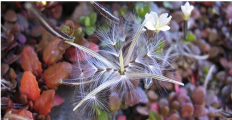
1. Epilobium microphyllum , willowherb.

The full results and comments may be found on the Network web site – www.nzpcn.org.nz