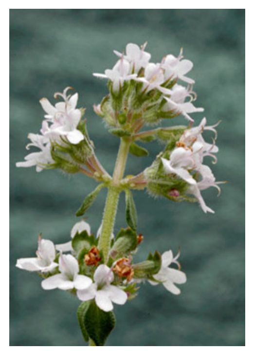
In cult. ex Clyde. Nov 2008.