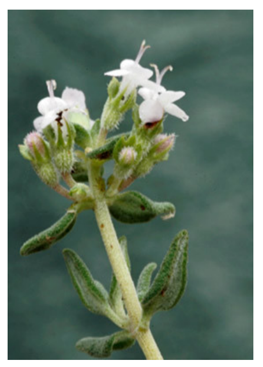
In cult. ex Clyde. Nov 2008. Photographer: Colin C. Ogle, Licence: CC BY-NC.