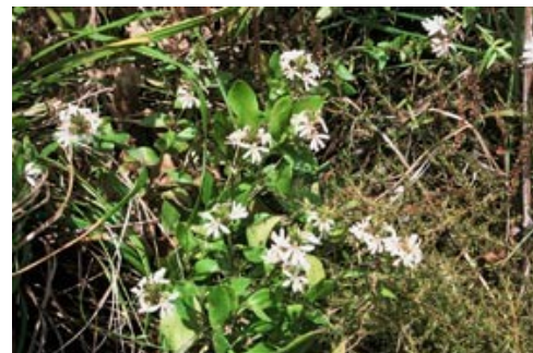
Taken in December.