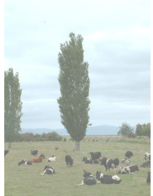
Populus nigra.