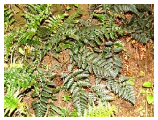
Wellington coast.