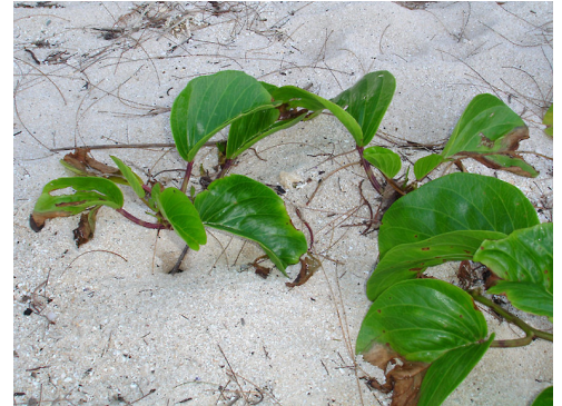
Ipomoea pes-caprae subsp. brasiliensis . Photographer: Peter J. de Lange, Licence: CC BY-NC.