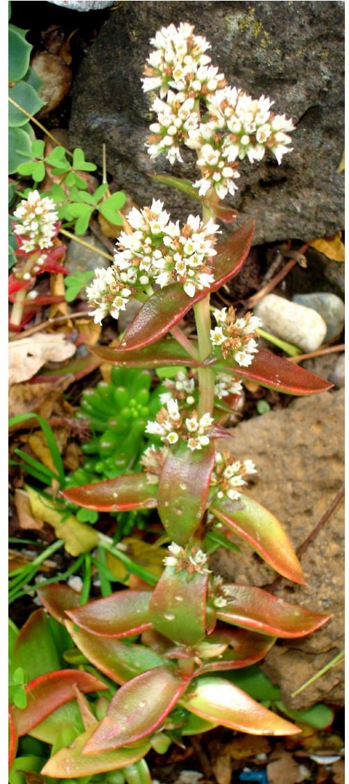
Crassula dejecta. Photographer: Peter J. de Lange, Licence: CC BY-NC.