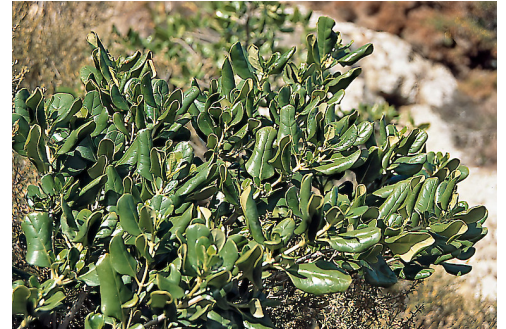
Eastbourne. Date taken: 08/06/2001, Licence: CC BY.