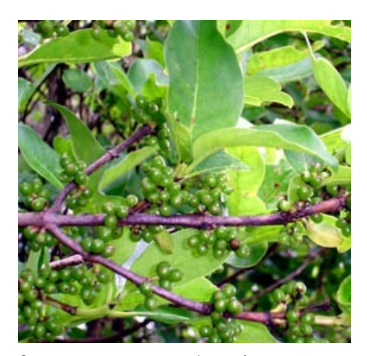
Coprosma macrocarpa subsp. minor. Photographer: Peter J. de Lange, Licence: CC BY-NC.