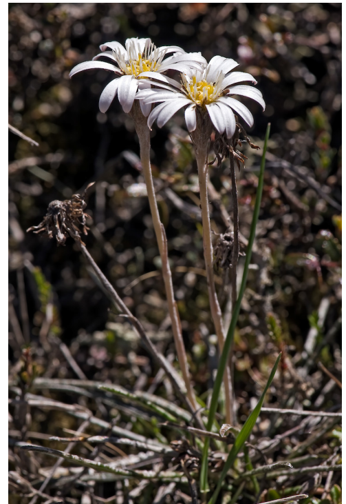
Desert Road. Photographer: Jeremy R. Rolfe, Date taken: 30/11/2008, Licence: CC BY.