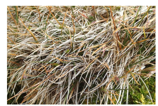
Macquarie Island.